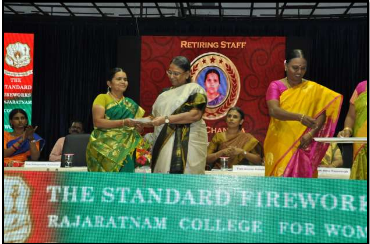
Felicitation for Retiring Staff (Non-Teaching)

(Affiliated to Madurai Kamaraj University, Re-accredited with “A” Grade by NAAC, College with Potential for Excellence by UGC and Mentor Institution under UGC PARAMARSH)